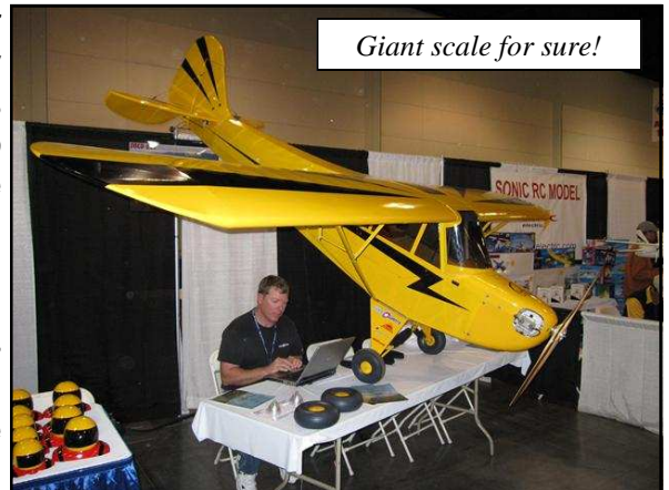
Giant scale for sure!

your hands—and don't forget to bring your cash too!