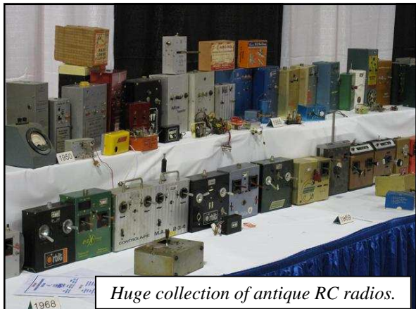
Huge collection of antique RC radios.

force last month, and lining up the workers at the event, and making sure everything ran smoothly. Thank you also to each of the club members who came to the convention center each day to work their "shift." I stopped in to check on the status of our club's booth on Friday, bringing club applications with me for the purpose of handing out to prospective members.