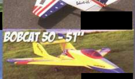
BOBCAT 50 - 51''