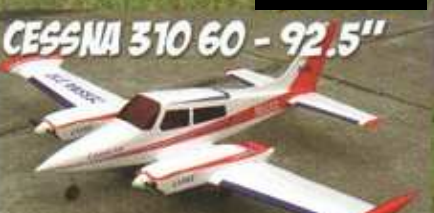
CESSNA 310 60 - 92.5''