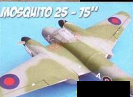
MOSQUITO 25 - 75''