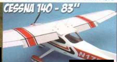
CESSNA 140 - 83''