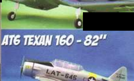
AT6 TEXAN 160 - 82''