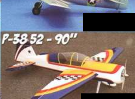
P-38 52 - 90''