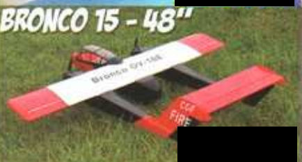
BRONCO 15 - 48''