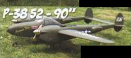
P-38 52 - 90''