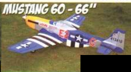
MUSTANG 60 - 66''