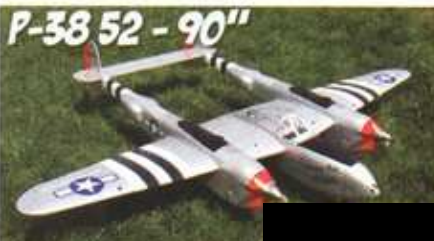
P-38 52 - 90''