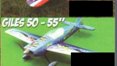
GILES 50 - 55''