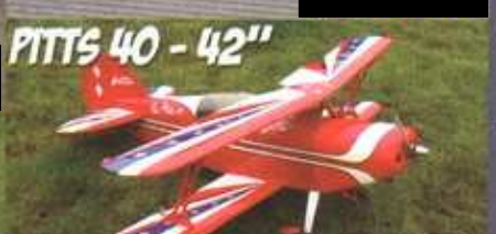
PITTS 40 - 42''