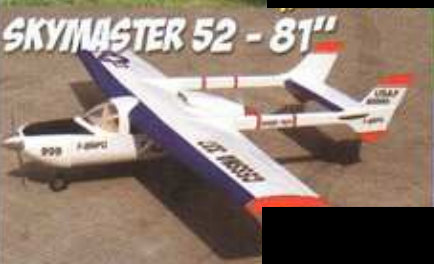
SKYMASTER 52 - 81''