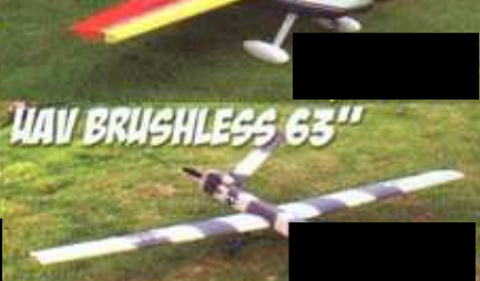
HAWK BRUSHLESS 63''