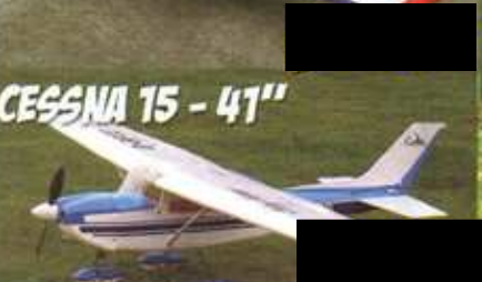
CESSNA 15 - 41''