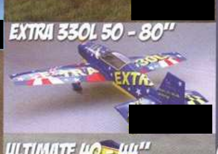
EXTRA 330L 50 - 80''