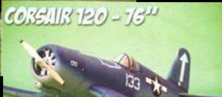
CORSAIR 120 - 76''