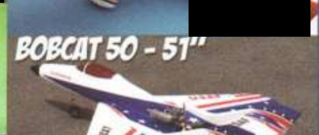
BOBCAT 50 - 51''