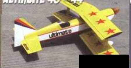
ULTIMATE 40 - 44''