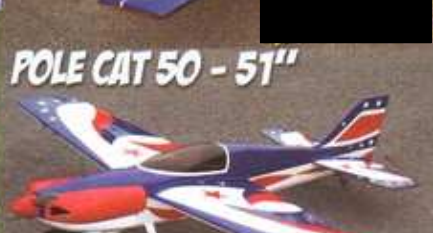
POLE CAT 50 - 51''