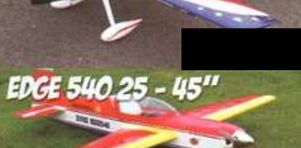
EDGE 540 25 - 45''