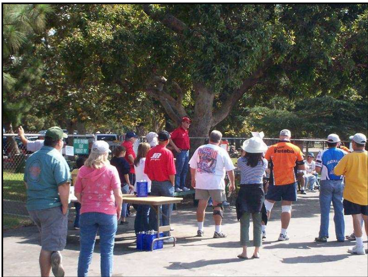
A race can't start without a pilot's meeting!