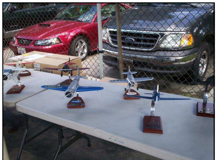
Check out these great event trophies!