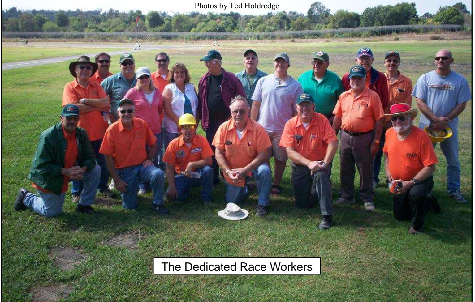
The Dedicated Race Workers