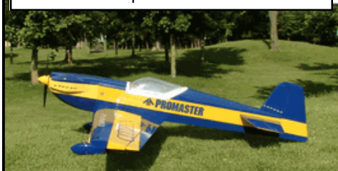
for the meeting raffle is the Cap 232.