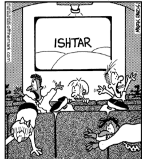
PANIC ON FLIGHT 117 AS THEY DISCOVER A BOMB ON BOARD.